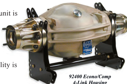
92400 Econo/Comp 4-Link Housing

and is extremely accurate. There is zero stress from bending and welding typical to sheet metal rears. It assures you of a housing that is properly aligned for optimum internal efficiency. The modular unit is also upgrade-able, if, at a later date a class change requires full floating hubs or the width needs to be changed, the appropriate end bells can be bolted on, eliminating cutting and welding. The newest addition to our modular line is the Econo/Comp 4 link housing (shown at right). It incorporates special chromoly 4 link brackets and spacers along with a tubular lower tie bar. These new components make it easier than ever to convert a MW modular solid mount dragster housing to a 4 link set-up. Component interchange-ability is guaranteed with this precision unit.