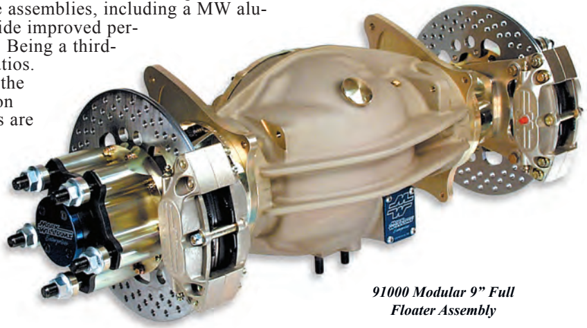
91000 Modular 9" Full Floater Assembly

The MW floater unit incorporates sealed ball bearings (self lubricating) for minimum drag. The Floater hubs are available with a 5" or 5-1/2" bolt circle. Complete rears include full floater assemblies with a one-piece axle, (standard width only) and a large pinion thirdmember. Steel or Carbon/Carbon Disc Brakes are available for superior stopping power along with substantial weight savings.