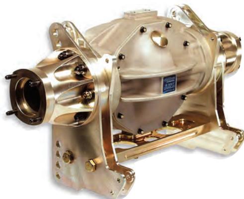
96012 Pro 4-Link 12 Bolt Housing