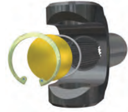
NEW! O-Ring Plug Seal

Like all MW product's they are laser engraved with part numbers and batch numbers that allow complete trace-ability. A new end of spline sealing feature features a o-ring seal with a tapered retaining ring that forces a aluminum plug against the seal. This improved method has proven to eliminate fluid seepage.