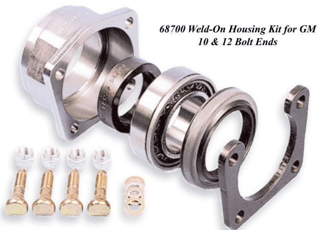
68700 Weld-On Housing Kit for GM 10 & 12 Bolt Ends

The preferable method to obtain a reliable axle and bearing combination for Pro Street applications is the installation of our weld-on housing ends. MW has designed ends that accept the 45 mm bore Timken® bearing and a heavy-duty seal. A slightly bent housing can be corrected when installing new Pro Street weld-on ends. A variety of kits are available that accommodate the most popular brakes. If you are going to use disc brakes we recommend using the 58780 Symmetrical end kit that accepts the best designed brake kits and can incorporate a parking brake