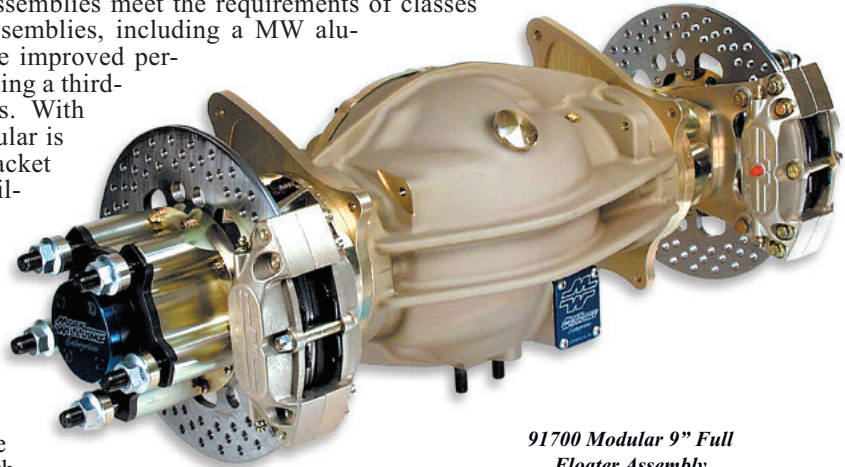
91700 Modular 9" Full Floater Assembly

The MW floater unit incorporates sealed ball bearings (self lubricating) for minimum drag. The Floater hubs are available with a 5" or 5-1/2" bolt circle. Complete rears include full floater assemblies with a one-piece axle, (standard width only) and a large pinion thirdmember. Steel or Carbon/Carbon Disc Brakes are available for superior stopping power along with substantial weight savings.