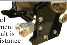
90039 Coil Over Shock Mount

The MW Modular 9" 4-link housing is available with 4130 steel 4-link suspension mounts. The steel brackets feature the key alignment lugs for extra strength. The result is a 17-1/4" 4-link center distance plus the added durability of steel brackets.