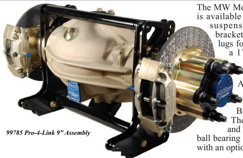
99785 Pro-4-Link 9" Assembly

The MW Modular 9" 4-link housing is available with 4130 steel 4-link suspension mounts. The steel brackets feature the key alignment lugs for extra strength. The result is a 17-1/4" 4-link center distance plus the added durability of steel brackets.