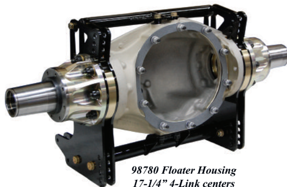
98780 Floater Housing 17-1/4" 4-Link centers