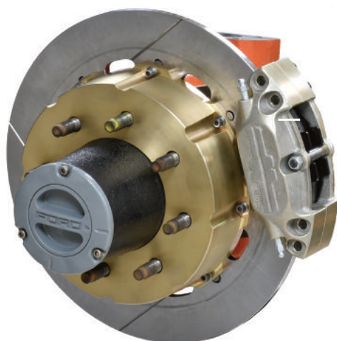
75910 Kit on Reid Racing Ford King Pin Knuckle